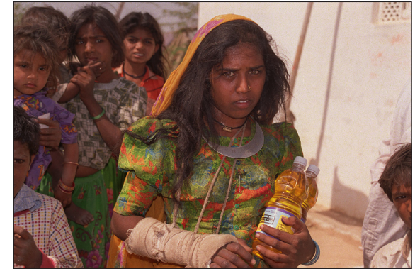
Distribution of cooking oil in Gujarat, India after a major earthquake.