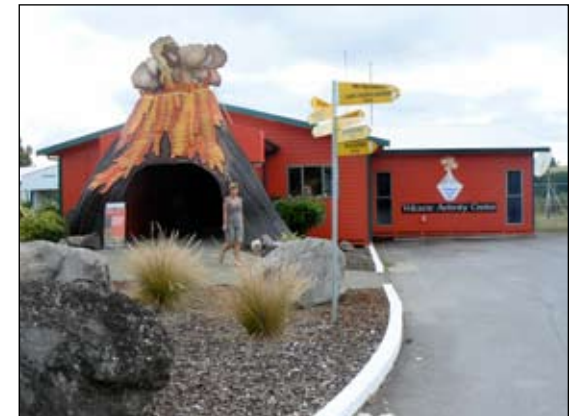
Although they are different volcanoes to the Auckland ones the volcanoes featured at the Volcanic Activity Centre near Huka Falls, Taupo are worth a visit if you are passing on holiday.